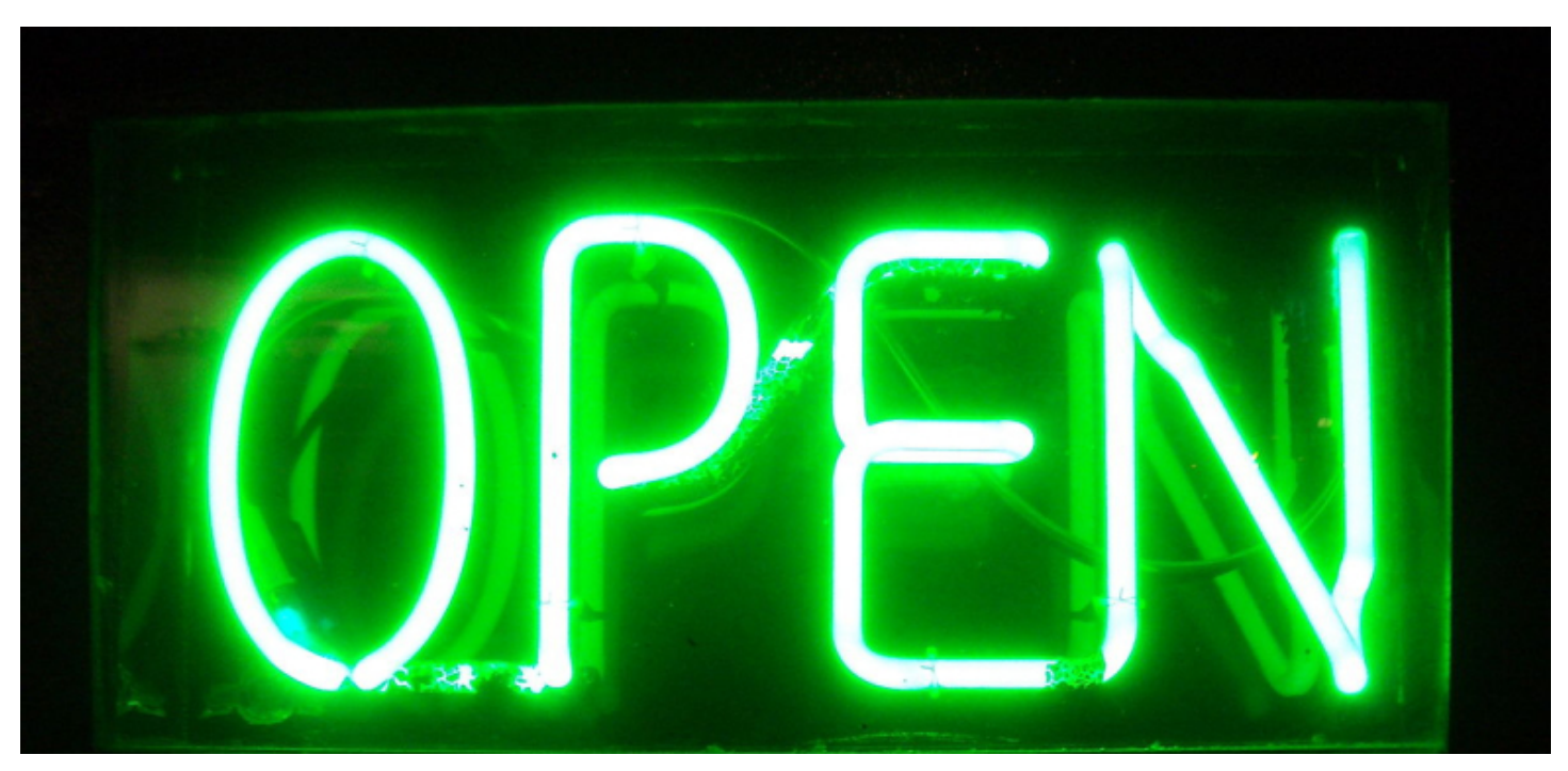
«Neon Open green»